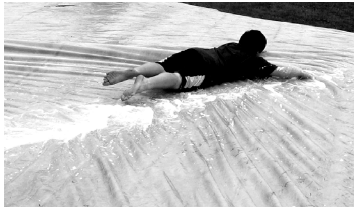
Slippery Slide at Camp Agape