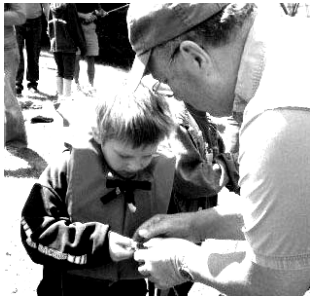
Baiting the Hook at Camp Agape

I first heard about Camp Agape from a fellow mentor at Charlotte Central School. I was intrigued about a camp especially for children whose parents were caught up in the criminal justice system. Recently retired, I knew I wanted to work with disadvantaged children and realized that Camp Agape was exactly what I was looking for -- a clear need in a program where I could make a significant direct contribution.