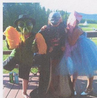
Campers having fun with dress up clothes

"I want to stay here forever. I wish I could clone myself and send my clone home."