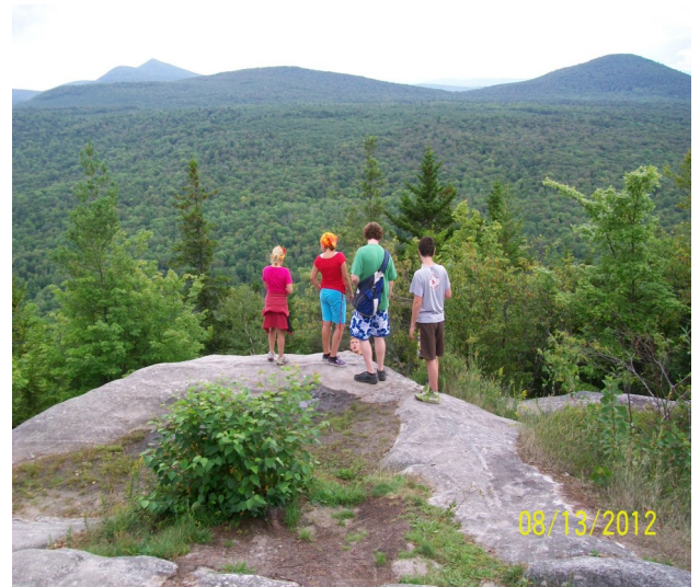
The wonder of creation at Groton State Park.

“The real point of being alive is to evolve into the person you were meant to be.” An older camper’s bedside poster