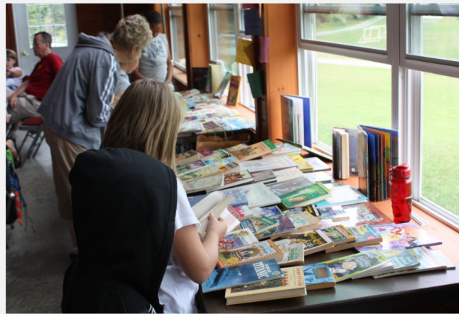
Choosing books after lunch.

At Covenant Hills Christian Camp Cabot, VT