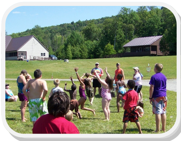
The Water Balloon Toss

This summer, we will again offer, free of charge, a week of camp to forty 8-11 year olds who have experienced a parent or significant caregiver's incarceration. We can also offer 24 camperships to our older campers, ten of whom can choose the special camp session for "Older Kids".