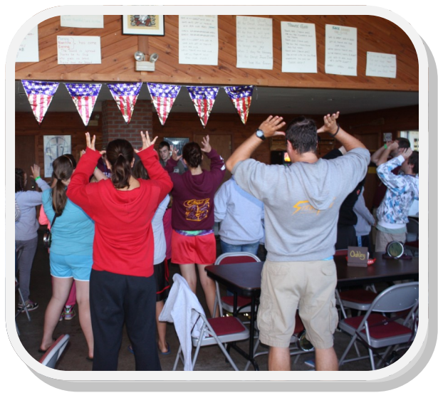
Singing the Moose song

Thanks also to the individuals and congregations that have continued to support Camp Agape in these tough economic times.