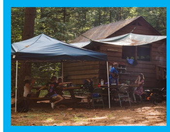
sleeping and eating