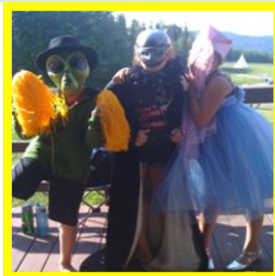
Campers having fun with dress-up clothes

A counselor and a camper were talking about smoking. The camper said: "I'm not going to smoke because I want to be a Camp Agape counselor someday."